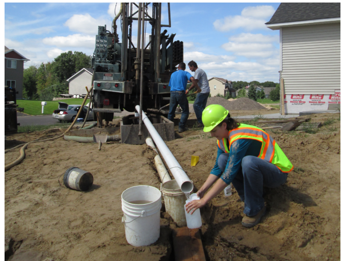
MDH staff takes a water sample at a newly constructed well.

including nervous system problems, skin disorders, high blood pressure, and reduced intelligence in children. Studies have also linked long-term exposure to arsenic in drinking water to increased risk of cancer of the bladder, lungs, liver, and other organs.