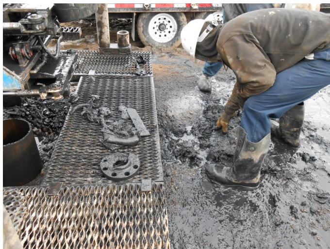
Removing debris from the Marshall Processing Plant well in preparation for sealing.

This one improperly sealed well was wasting over 26 million gallons of groundwater every year. Groundwater is the main source of drinking water for three out of every four Minnesotans. In the Marshall area, as well as other areas of Minnesota, cities, industries, and rural water providers are looking for additional water supplies. Sealing unused wells helps maintain adequate water availability in the region and prevent contamination from reaching groundwater supplies.