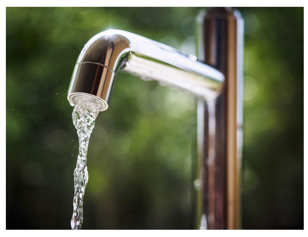
Reducing Lead in Drinking Water:

A TECHNICAL GUIDANCE FOR MINNESOTA'S SCHOOL AND CHILD CARE FACILITIES