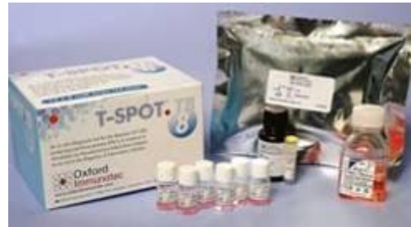
T-SPOT TB Test Materials

Adapted from CDC Self Study Module 3 – Targeted Testing and the Diagnosis of Latent Tuberculosis Infection and Tuberculosis Disease