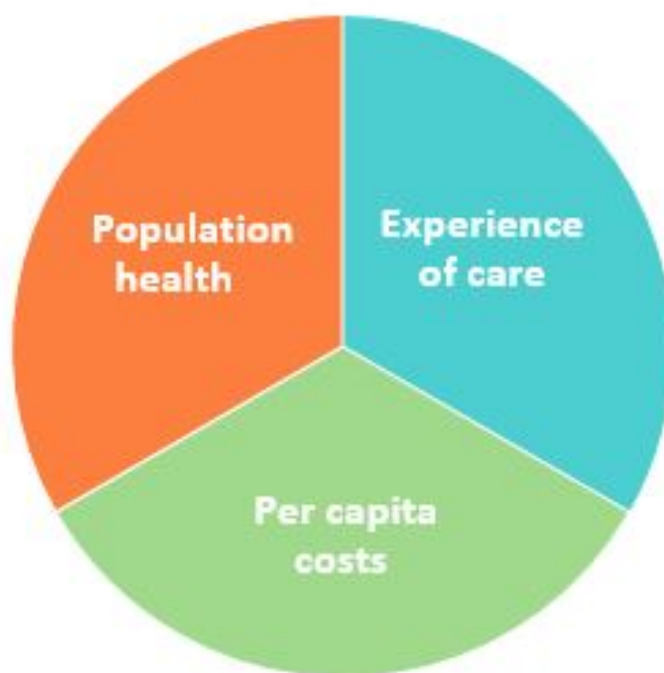
FIGURE 1. THE TRIPLE AIM OF HEALTH CARE

Source: Adapted from the IHI Triple Aim. Institute for Healthcare Improvement, Cambridge, MA.